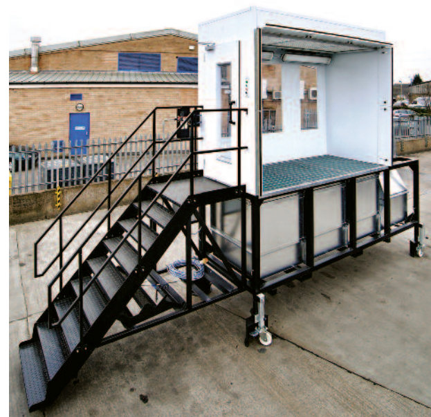
A mobile paint spray booth, developed for the IEP (Intercity Express Programme) project.

Due to the desire to conserve water, most new wash systems require a reclaim system, which enables approximately 70% plus of water to be reused.