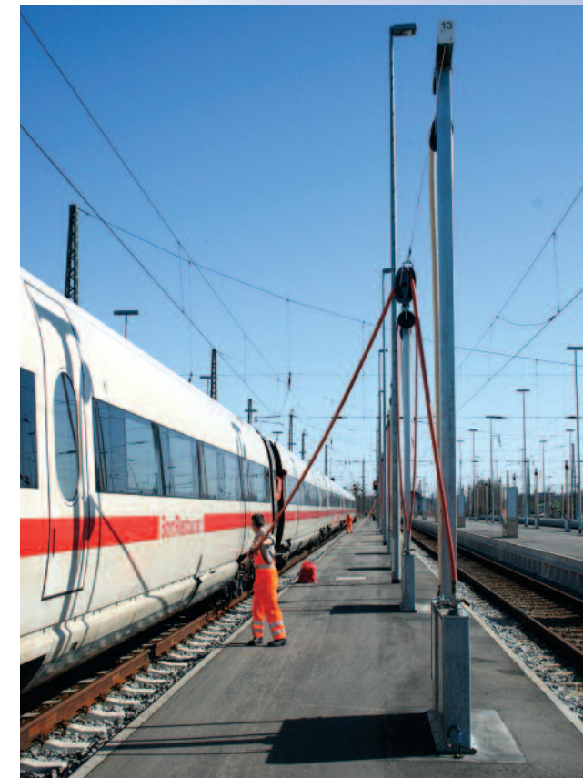
◁ The unique Vogelsang 'T' bar system.

Retractable hoses for our fixed or mobile systems mean fewer trip hazards and remote monitoring is possible.