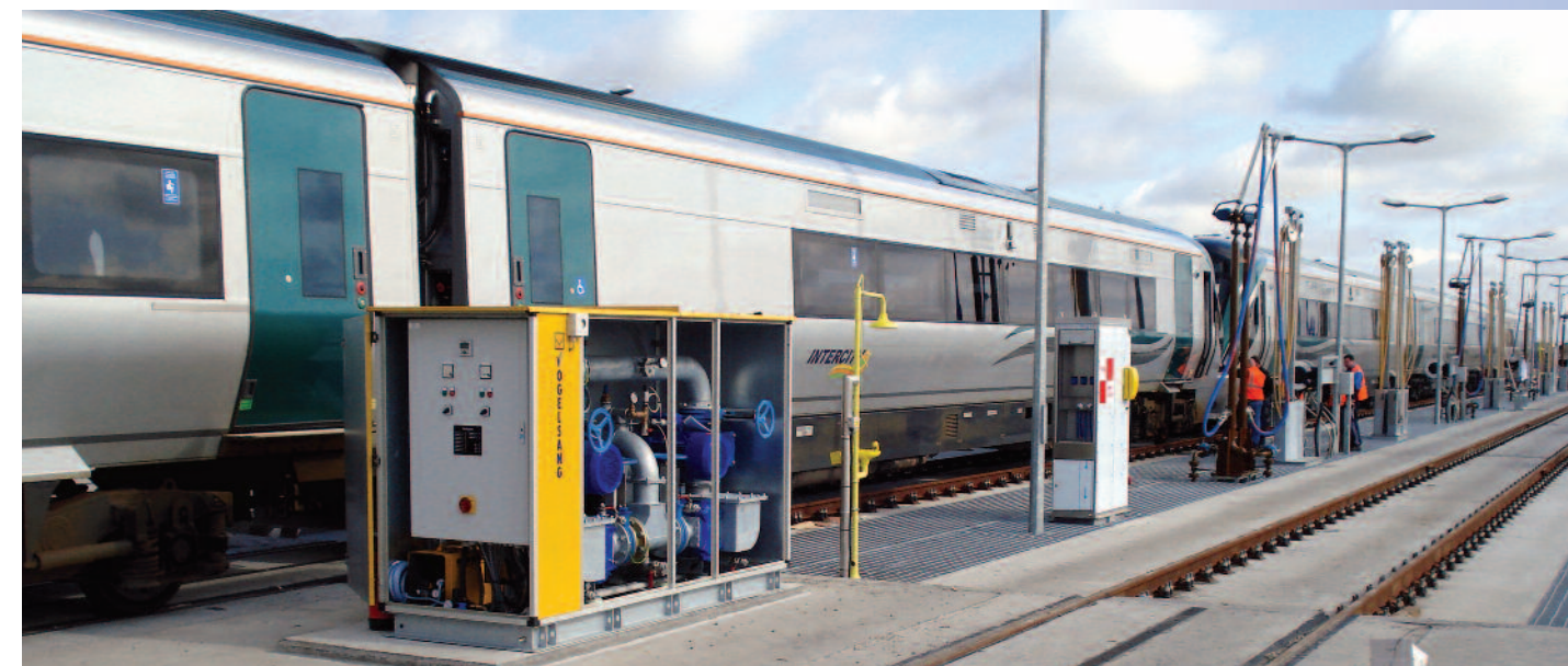
△ The Vogelsang double pumping system.